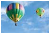
Hot Air Ballooning