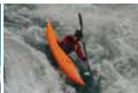
White Water Rafting