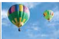
Hot Air Ballooning